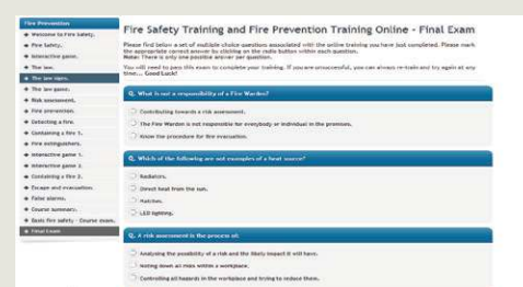
Final Exam – Certificates Provided.

Those responsible for workplaces must provide staff with suitable, sufficient and appropriate training to help prevent the outbreak of fire.