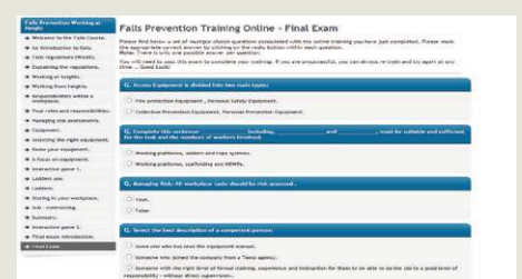
Final Exam – Certificates Provided.

All businesses employing staff who work at height are required to provide training to reduce the risk of falls.